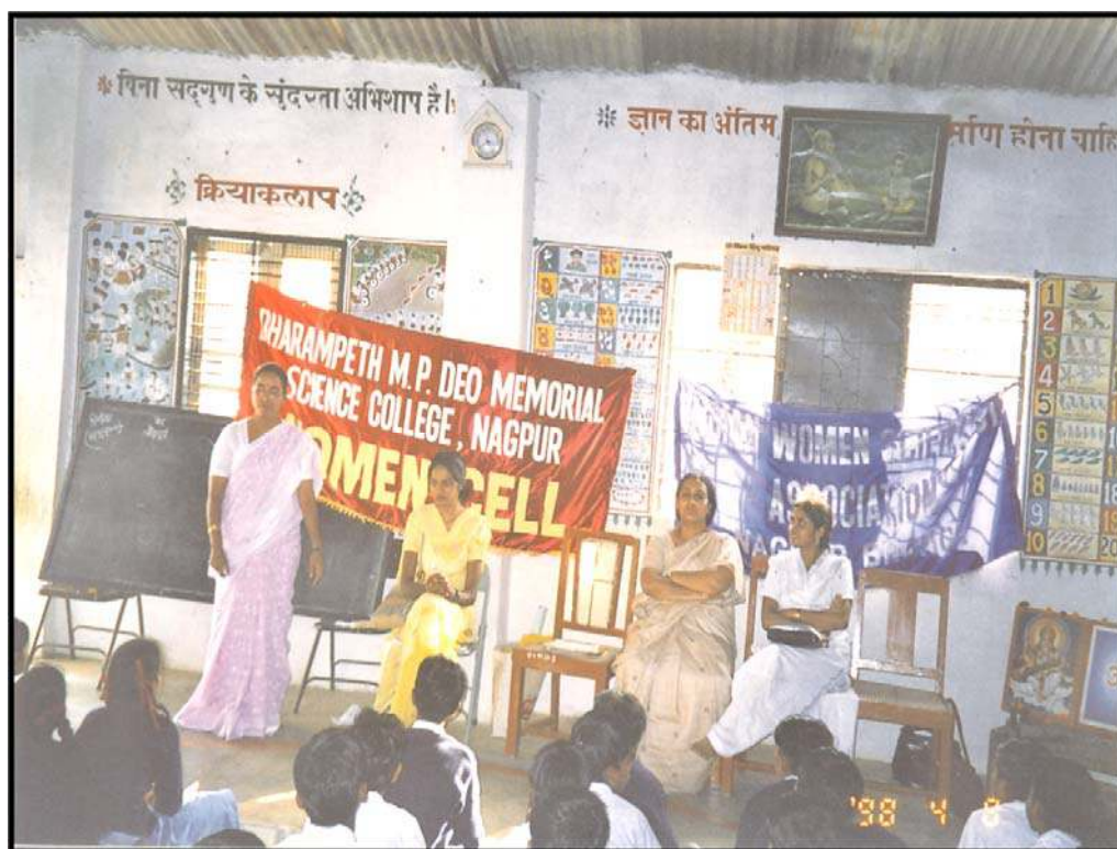
Members of the Women Cell giving instructions to the School Children