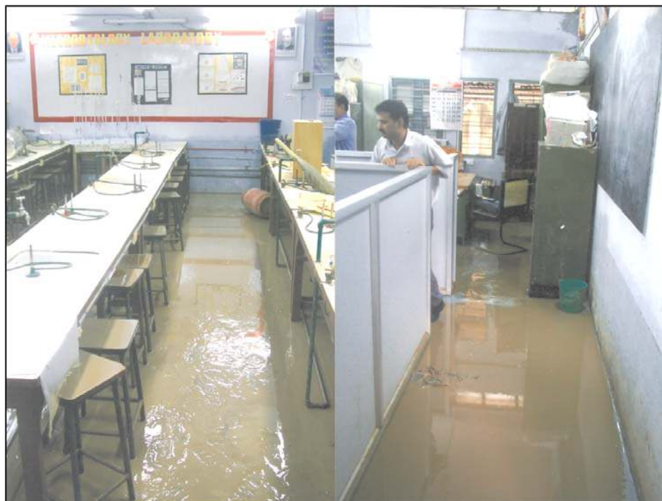
Microbiology Laboratory & Administrative Office

Water level in the premises of the college rose to nearly 4 feet and remained so overnight. Few photographs have been presented here just to give appraisal of the disaster and the extend of damage caused to our well established laboratories ,office records, auditorium etc.