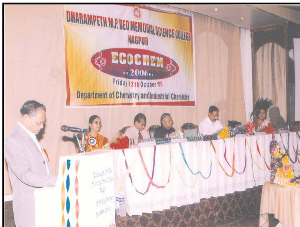
Principal delivering address at the Inaugural Function of Eco-chem-2006