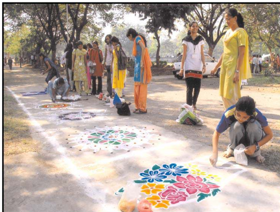
Enthusiastic participants in Rangoli Competition