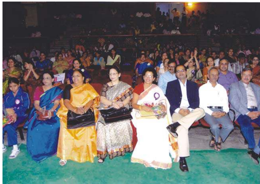
Dignitaries in the audience