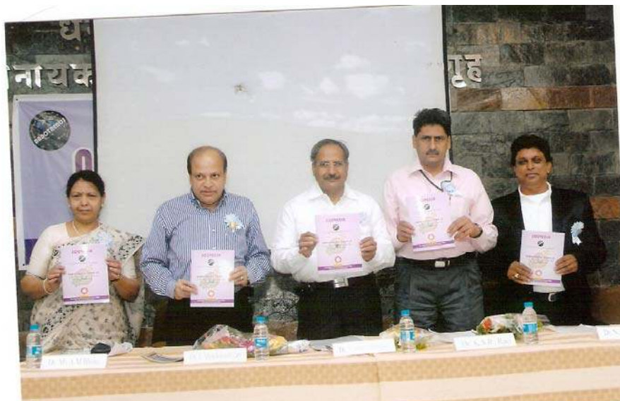
Release of Souvenir

honour and Key Note Speaker. In his Key Note address he explained all the facets of Nanotechnological applications in a lucid manner. He also released a Souvenir.