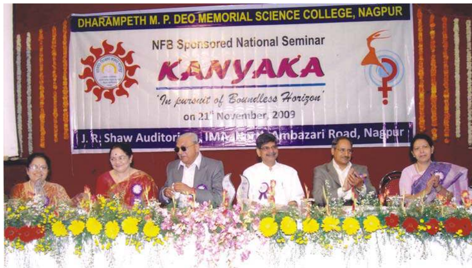
Dignitaries on the stage at the inaugural function of National Seminar :KANYAKA

The seminar received overwhelming response.